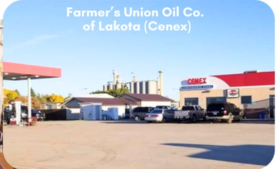
Farmer’s Union Oil Co. of Lakota (Genex)