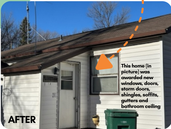
This home (in picture) was awarded new windows, doors, storm doors, shingles, soffits, gutters and bathroom ceiling

In 2025, the final five homes were rehabilitated as part of the Nelson County Housing Rehabilitation program.