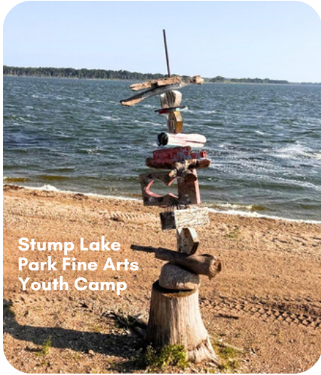
Stump Lake Park Fine Arts Youth Camp

The Nelson County Arts Council (NCAC) , a volunteer-driven nonprofit based in Pekin, continues to play a vital role in supporting arts and community life through a wide range of events including art shows, auctions, student exhibits, and programs in nursing homes.