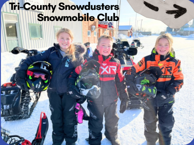
Tri-County Snowdusters Snowmobile Club