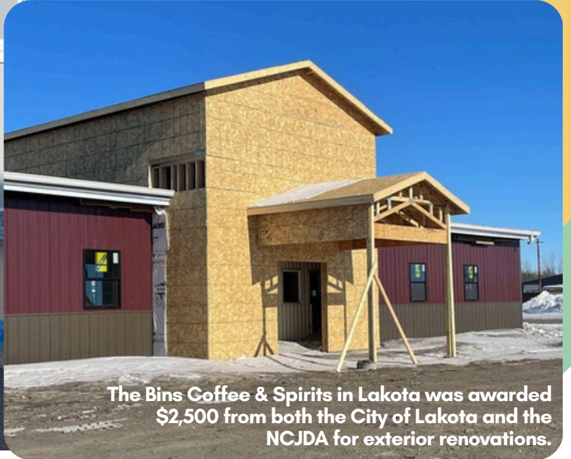
The Bins Coffee & Spirits in Lakota was awarded $2,500 from both the City of Lakota and the NCJDA for exterior renovations.