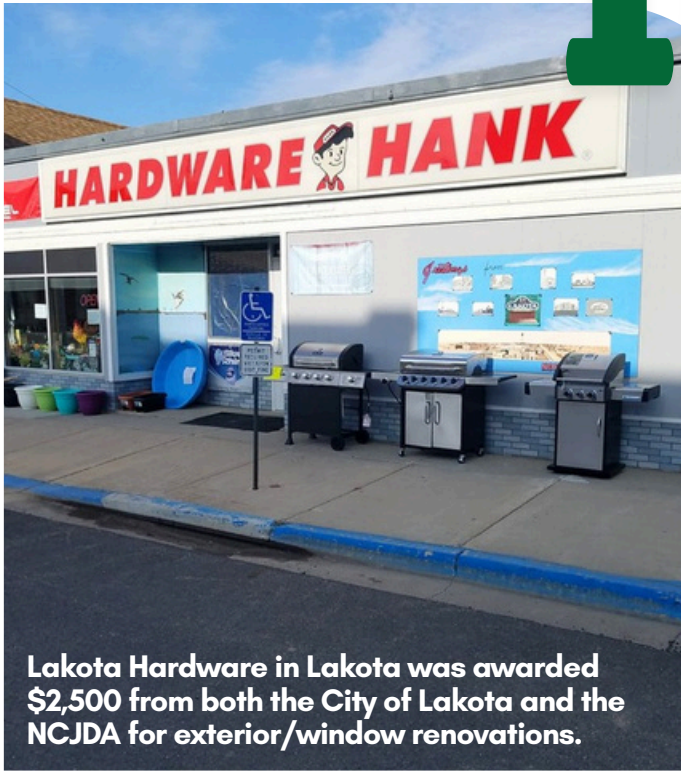
Lakota Hardware in Lakota was awarded $2,500 from both the City of Lakota and the NCJDA for exterior/window renovations.